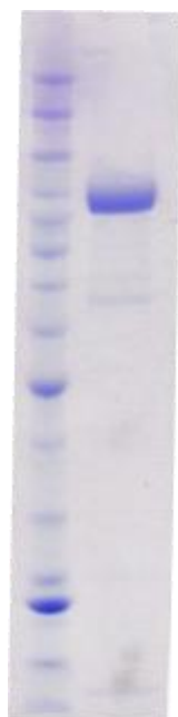
Coomassie blue stained SDS-PAGE (4-12% acrylamide) of 2 μg and 4 μg of purified SUV39H2 (His). MW markers at right, from top are: 220, 160, 120, 100, 90, 80, 70, 60, 50, 40, 30, 25, 20, 15 & 10 kDa.

REFERENCES: 1) D. O'Carroll et al. Mol. Cell. Biol. 2000 20 9423 2) S. Rea et al. Nature 2000 406 593; 3) A.H. Peters et al. Cell 2001 107 323; 4) M. Garcia-Cao et al. Nat. Genet. 2004 36 94; 5) A. Syreeni et al. Diabetes 2011 60 3073; 6) K.A. Yoon et al. Carcinogenesis 2006 27 2217